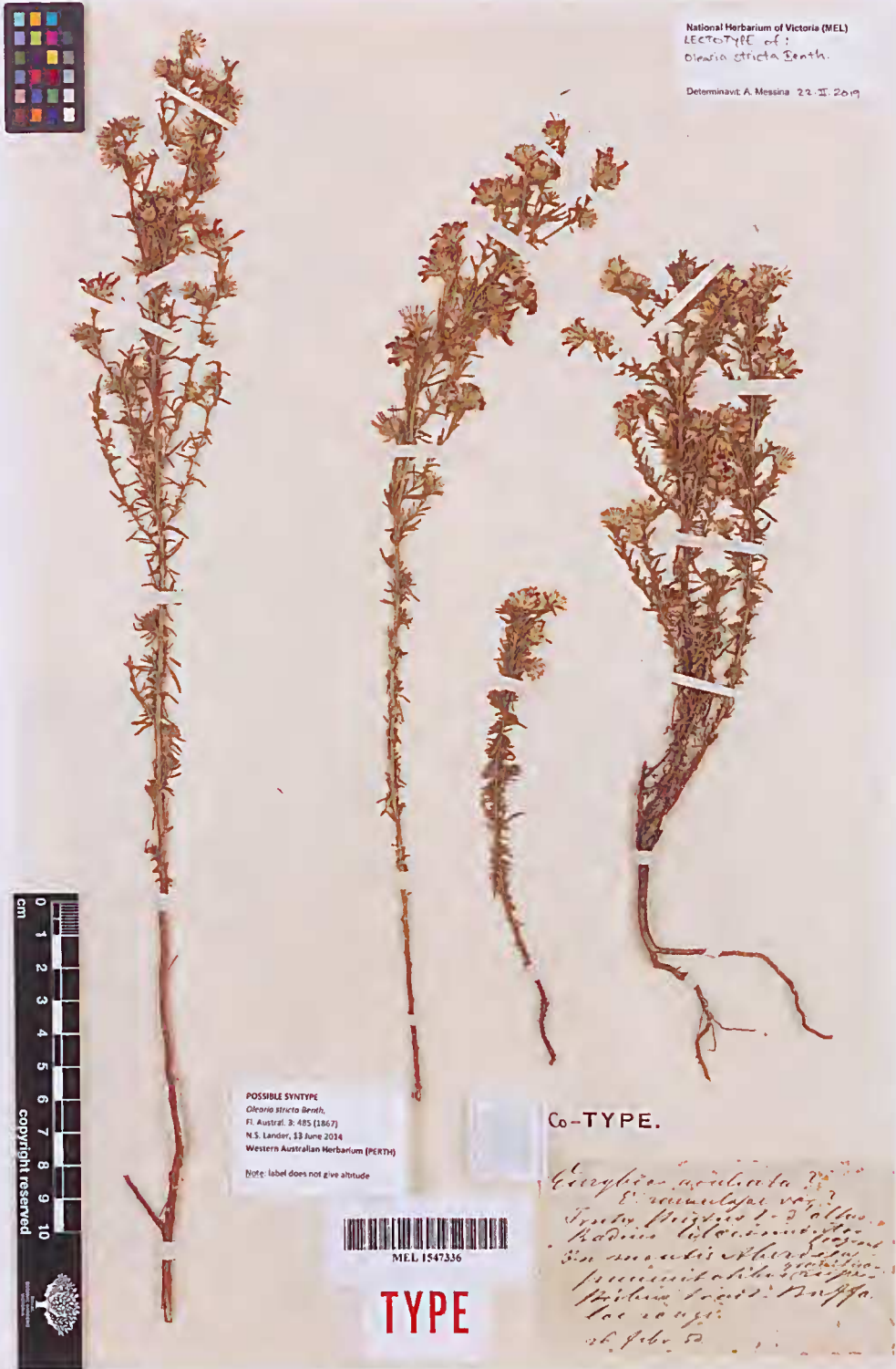
Figure 1. Lectotype of Olearia stricta (MEL1547336).